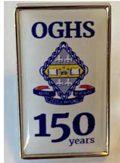
150th badge distributed to students on 5 February.

in this newsletter) outlining the foundation and history of our school. On leaving the assembly all students were given a 150th badge to mark this historic occasion. In the afternoon students enjoyed a garden party to continue the celebrations. It was a lovely day in the life of the school!