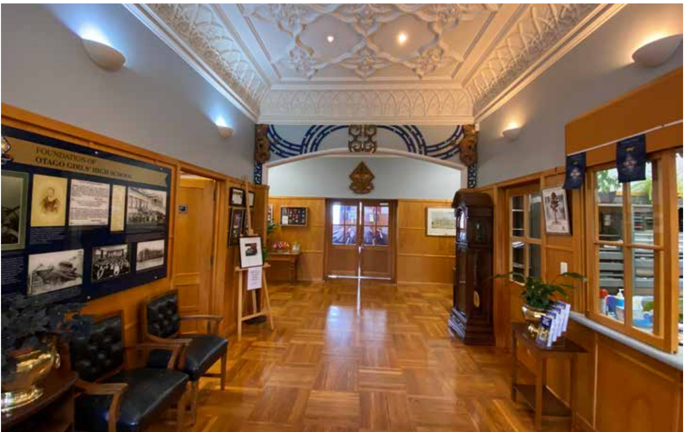
Newly installed pare in the school foyer.